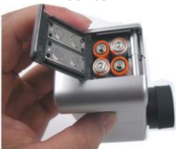
Use 4 x AAA batteries.