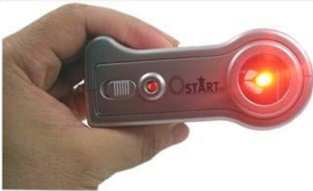
Search pinhole camera lens through IR & laser.