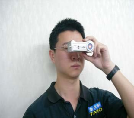
Observe camera with naked eyes through the device.